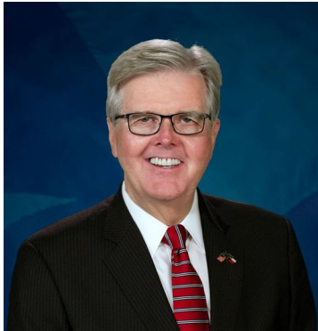
Lt. Gov. Dan Patrick